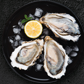
*Raw Oysters (6 pcs) $15