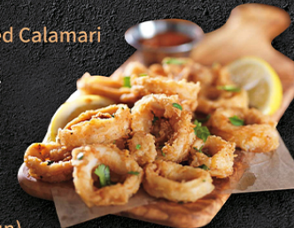
Fried Calamari $12