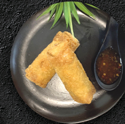
Pork Egg Rolls $4.95