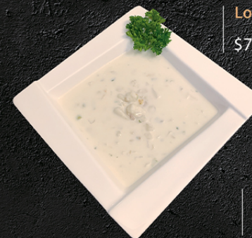
Lobster Bisque $7