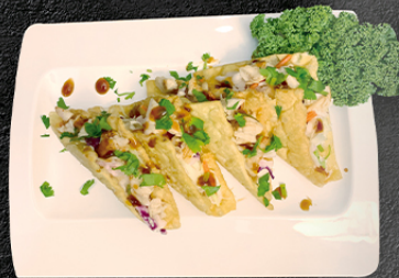
Crispy Chicken Wonton $9.95