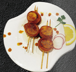
Bacon Scallops $15.95