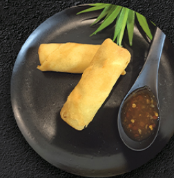
Vegetable Spring Rolls $4.95