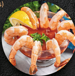
Cocktail Shrimp (8 pcs) $10.95