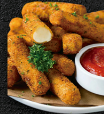
Mozzarella Cheese Sticks $5.95