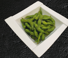
Cajun Spiced Edamame $4.95