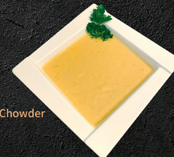
Clam Chowder $5.5