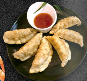
Fried Pork Dumpling $6.99