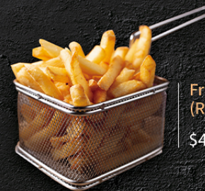
Fries (Regular or Cajun) $4