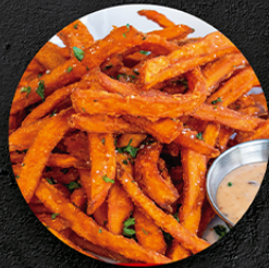
Sweet Potato Fries (Regular or Cajun) $4.95