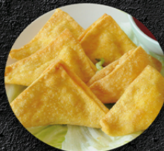
Crab Rangoons $6.95